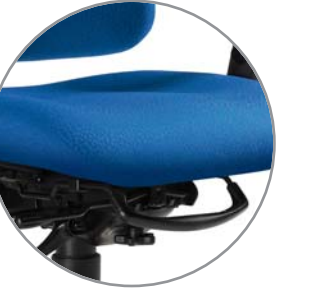
Multi-Depth (MD): Adjustable seat depth mechanism provides additional space and comfort. Standard on the following multitilter models: 4430, 4431, 4432, 4433, 4434.